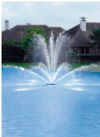
Large aerating fountains