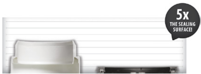
Oversized protection for leak-free operation